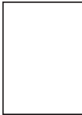
Vacant Boys Lacrosse Official Term Expires 2023 Division 1